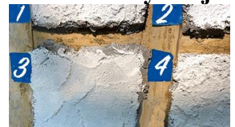
Stucco: 4 different texture styles