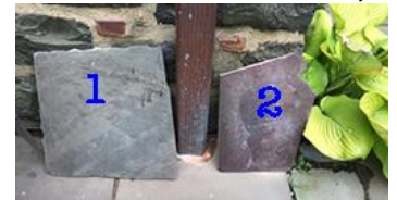
Blue Stone: 2 color samples