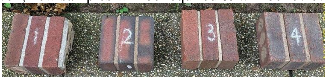
Brick & mortar samples labeled for easy reference

New mortar and some new bricks are needed to repair and repoint this half-moon stoop. The contractor will provide samples to be reviewed by the Architecture Committee. If the samples do not match well, new samples will be required & will be reviewed again.