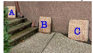
Aggregate with Crushed Clay: 3 samples showing color & texture