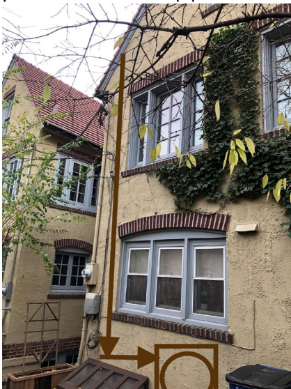
Marked Photograph showing location of planned AC unit and pipes.